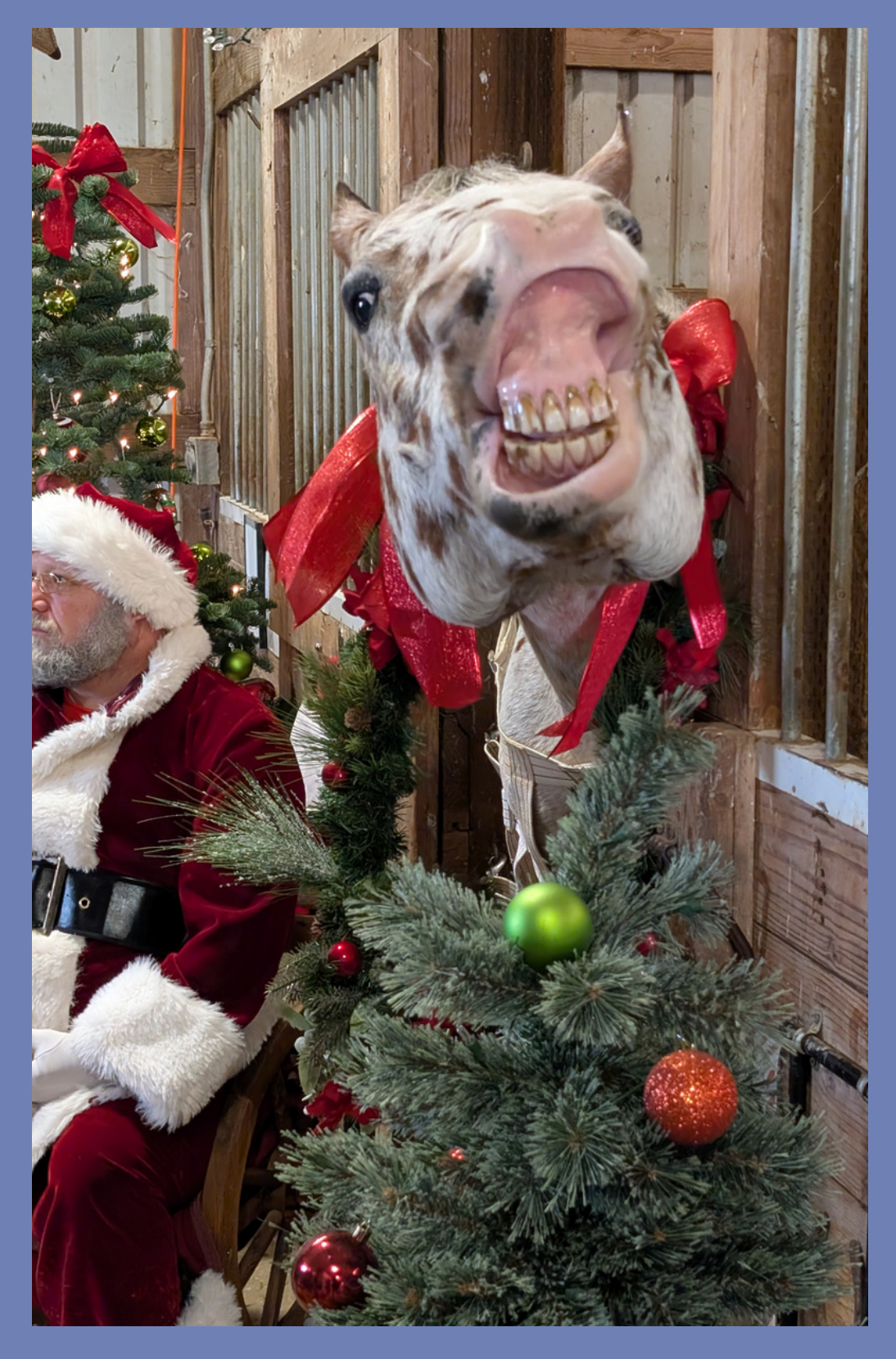
HAPPY HOLIDAYS AND A WONDERFUL NEW YEAR!